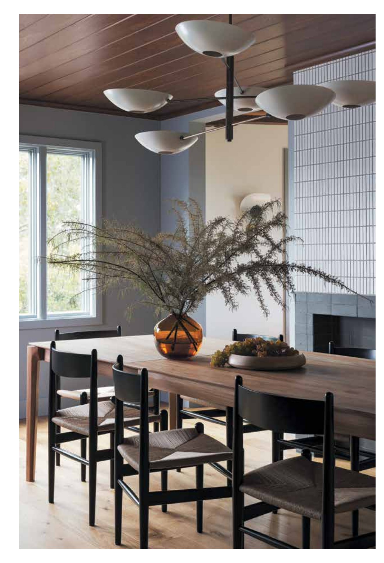
In the dining room—painted in Benjamin Moore's Delray Gray—a teak table by Ethnicraft is combined with chairs from DWR and a Blueprint Lighting chandelier.