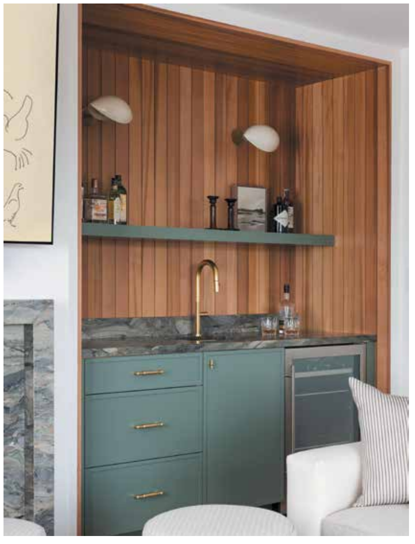
A bar in the family room, tucked into a cedar-lined niche, features Fusion quartzite, a brass sink from Rejuvenation and Farrow & Ball's Card Room Green paint.

by ANH-MINH LE